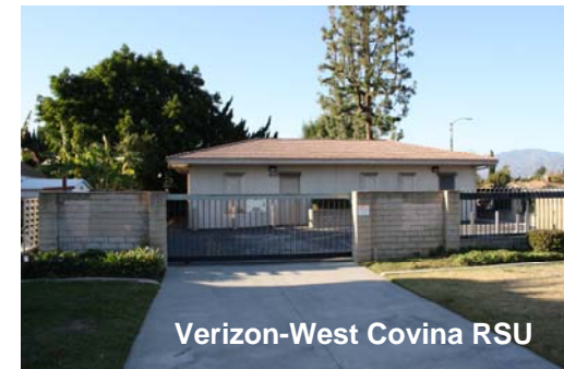
Verizon-West Covina RSU