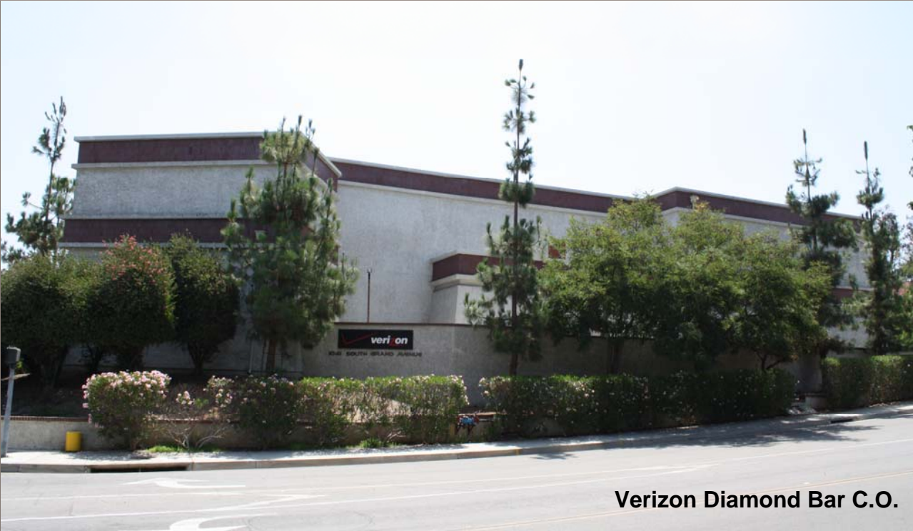
Verizon Diamond Bar C.O.