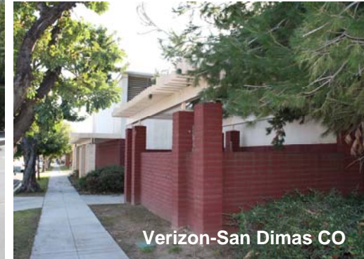
Verizon-San Dimas CO